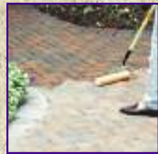
Apply by roller or spray

Apply product by brush, roller, spray or squeegee to thoroughly dry surface. Air and surface temperatures should be above 50°F and the relative humidity below 60%. One coat application is suggested. Do not apply in direct sunlight or if rain or heavy dew is expected within 24 hours. Spread evenly do not allow puddles or a heavy surface film to occur. Not for use on wood, metal, granite, marble or asphalt surfaces.