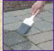
Apply by brush

NOTE: Power washing is an effective method of cleaning masonry, however due to their high pressure, power washers trap residual moisture in the masonry. This may cause the coating to cloud. Eventually the coating will clear, but to avoid this clouding, it is important for the masonry to be completely dry prior to the application of the coating. To check for moisture, try this simple test: Tape a 12" x 12" piece of aluminum foil or 3 mil plastic sheeting tightly on all four edges to prepped surface. Remove after several days. If the ground side is wet, you have trapped moisture and need to wait for the surface to completely dry.