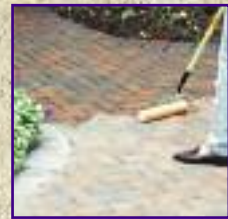
Apply by roller or spray

Apply product by brush, roller, spray or squeegee to thoroughly dry surface. Air and surface temperatures should be above 50°F and the relative humidity below 60%. One coat application is suggested. Do not apply in direct sunlight or if rain or heavy dew is expected within 24 hours. Spread evenly do not allow puddles or a heavy surface film to occur. Not for use on wood, metal, granite, marble or asphalt surfaces.